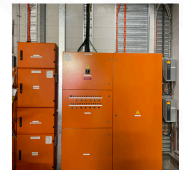
New MSSB Mechanical Services Switchboard