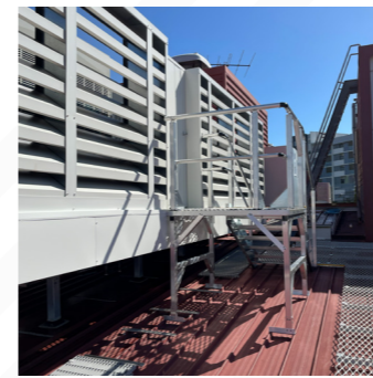
New Plant Deck