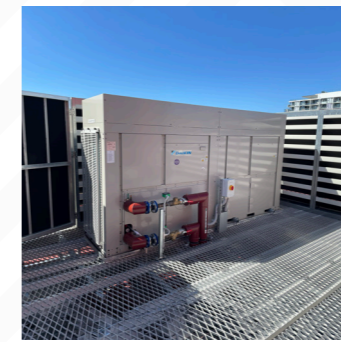
New Heat Pump on the new plant deck