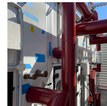
New AHU-8.3 Sections