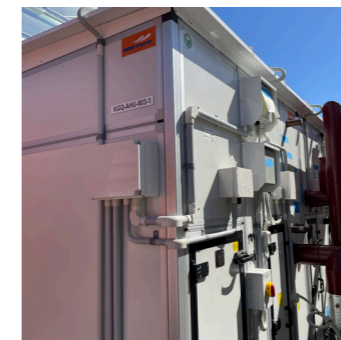
New AHU-8.3 supplies dehumidified air to the wet lab area.