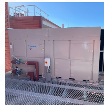
New Heat Pump on the new plant deck